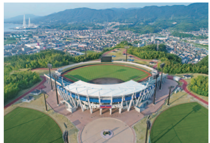
2018 Special Excellent Work Award Atago Sport Complex Baseball Field (known as Kizuna Stadium)

Meanwhile, the cultural exchange facility is a shared facility between US military personnel in Japan and Iwakuni citizens, and has a sport arena and various rooms such as Japanese-style rooms and cooking rooms for cultural exchange. The theme of the exterior was "Japanese," and special finishes were adopted everywhere, which required a high level of technical capabilities and creativity.